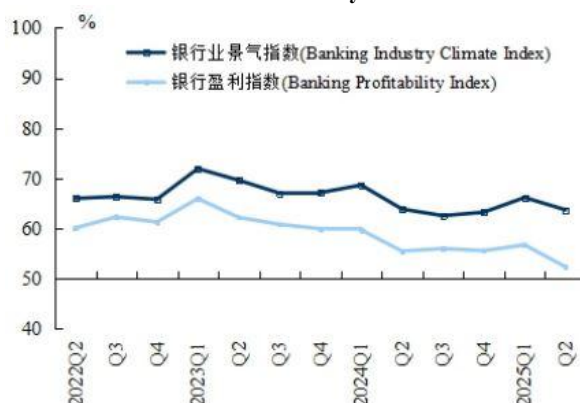
Figure 2: Banking Industry Climate Index and Banking Profitability Index