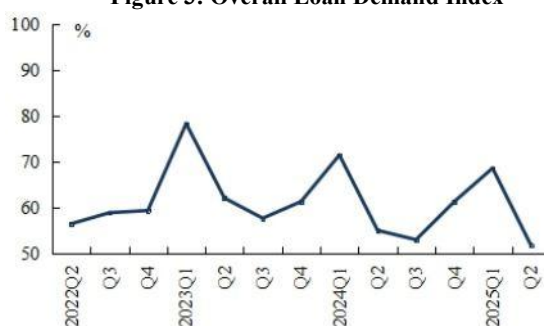
Figure 3: Overall Loan Demand Index